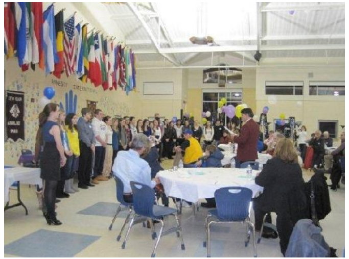
The Ashland LEO's Club members are sworn in