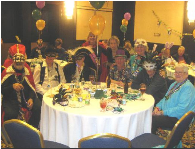
Ashland Lions came out for the Madi Gras activities