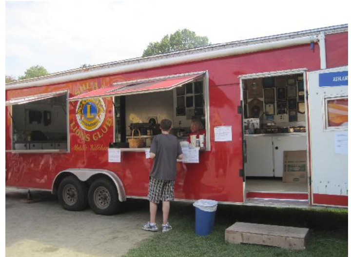
The Lion Mobile was on site to serve the community