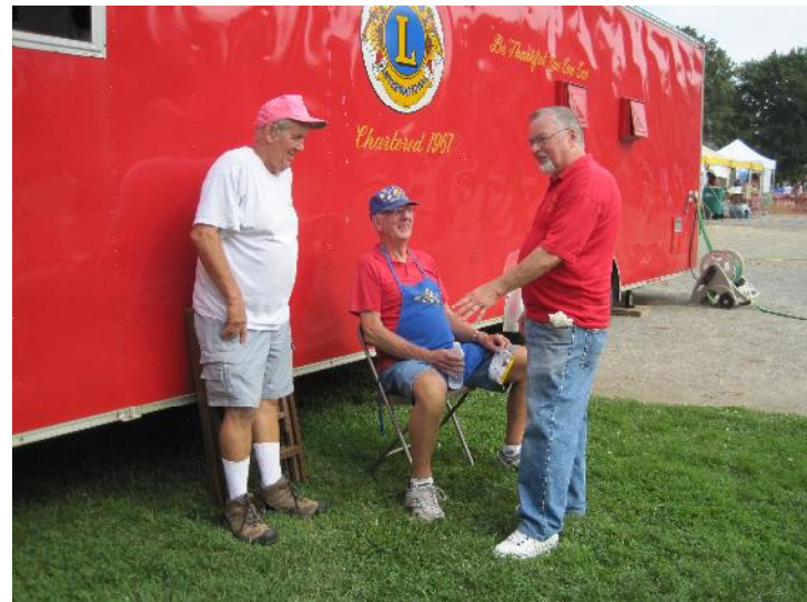
It was a great day and an exhausting one!