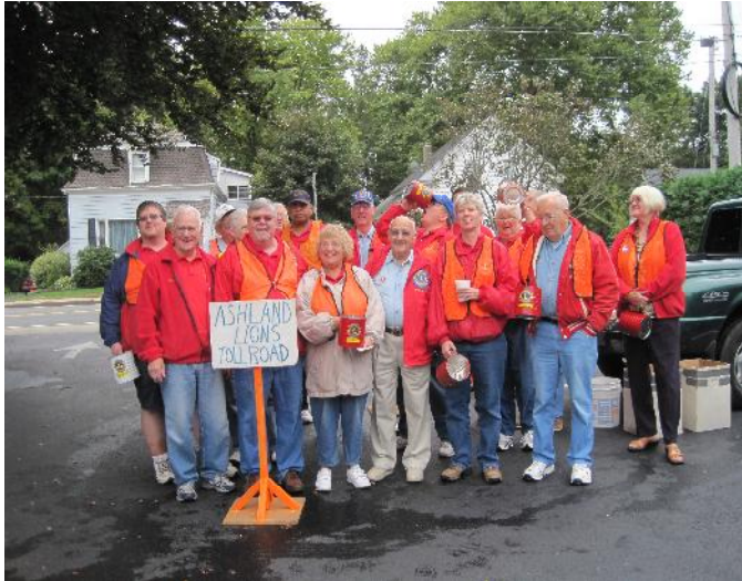
Lion's came out in force to play in traffic.