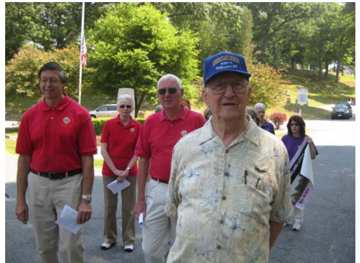
Ashland Lions came out to support and participate in the days activities.