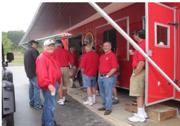
Ashland Lions came ready for the 1 st Annual Car Show – even if it was rained out!