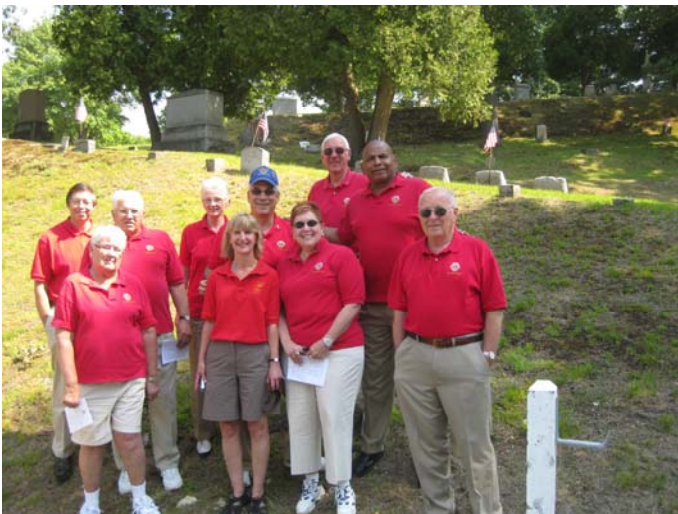
Ashland Lion's were well represented