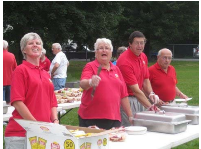
Ashland Lions were ready to serve!