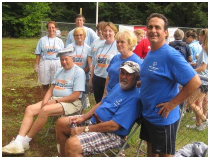
Once again Ashland Lion's were on site and ready for the games